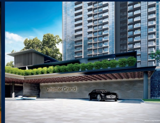
5 - Bedroom